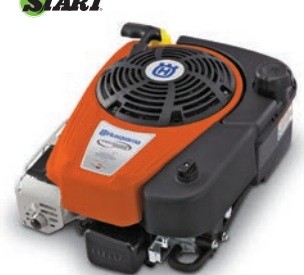
775ex HEAVY-DUTY APPLICATIONS