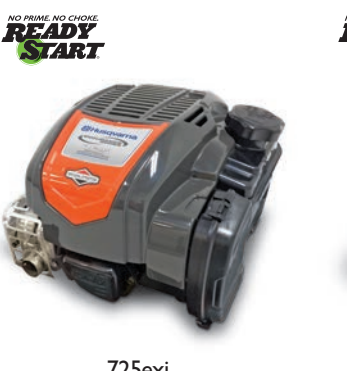
725exi MID TO HEAVY-DUTY APPLICATIONS