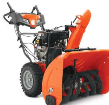
Two Stage 200 Series