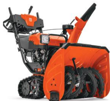
Two Stage 400 Series

When you own a Husqvarna snow blower, you can't wait for the snow. Premium engines, precision controls, heavy-duty construction and comfortable operation help power you through any winter.