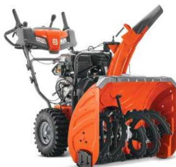
Two Stage 300 Series